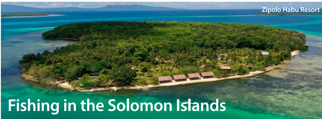
Zipolo Habu Resort