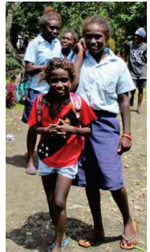
Local village schoolgirls on Titiru Island love wishing visitors "good morning".

(But don't expect the sophistication and ultra-modern conveniences of resorts and hotels in other more popular tourist destinations such as Bali, Fiji, Vanuatu or Vietnam. Thanks