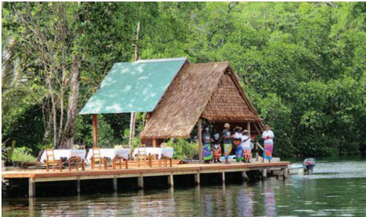
Friendly island welcome to isolated Titiru eco-resort in the Western Province of the Solomon Islands.