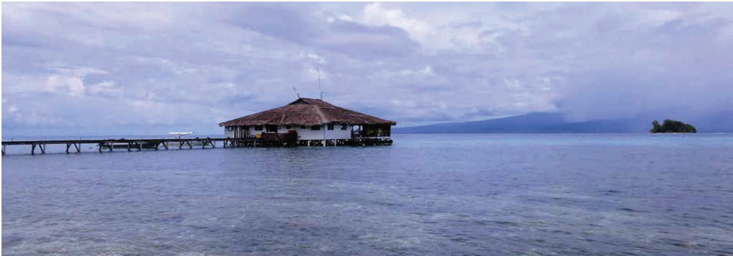
Fatboys bar and restaurant on the end of a picturesque pier..the resort's bungalows line the coral edged shores of the lagoon.