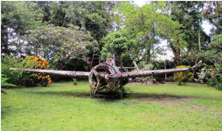
Wreck of a US Navy Wildcat carrier-borne fighter in an open-air wartime museum site near Honiara...its starboard wing is still retractable.

*Go55s was part of a media contingent invited to the area by the Solomon Islands Visitors office, Tourism Solomon, and Solomon Airlines in a bid to help boost tourism to the developing nation. We were guests of the Heritage Park Hotel, Honiara, Agnes Gateway Hotel, Munda and Fatboys Resort. *All resorts have their own websites so it’s worth checking tariffs and availability.