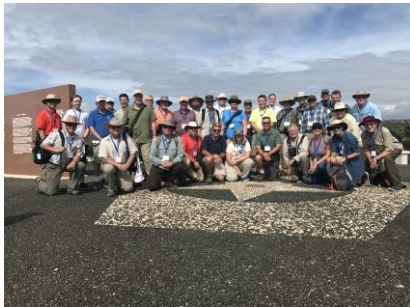
75 th Anniversary group at memorial, 2017