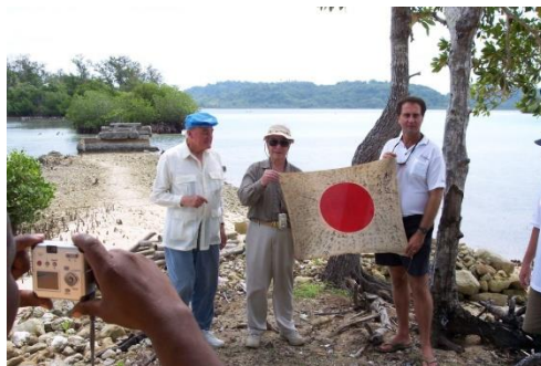
Found Japanese flag on Gavutu during 2004 tour