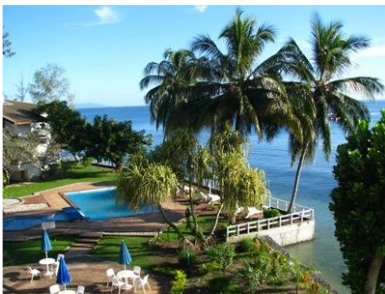
Grounds of our hotel located on Iron Bottom Sounds overlooking Savo Island.

To ensure worry free travel, we recommend emergency travel and cancellation insurance be purchased. This coverage is provided by TRAVELEX Insurance Services. A description of insurance coverage will be sent to each participant upon receipt of his/her application and deposit. Coverage includes sickness and accident medical expense; trip delay or missed flight connections; medical evacuation and repatriation; baggage and personal effects loss or delay; assistance services worldwide. Premium costs are: $187 per person for $3000 per person worth of coverage, $248 for $4000 per person worth of coverage, $313 for $5000 worth of coverage; $373 for $6000 worth of coverage. Call for higher coverage cost.