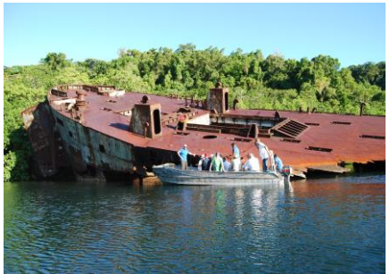
LST 342 in Tokyo Bay near Tulagi

The Solomon Islands campaign lasted twenty months. It was a violent air, land and sea struggle with a determined enemy. This tour offers WWII history and ceremony with sightseeing on this now peaceful and beautiful island. Walk invasion beaches and airstrips – cruise across Iron Bottom Sound past Savo Island, remembering the tremendous losses suffered by the Japanese response to the land invasions. Relics still abound although the jungle now mostly conceals the wounds of battle.