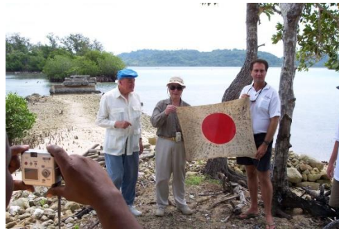
Found Japanese flag on Gavutu during 2004 tour