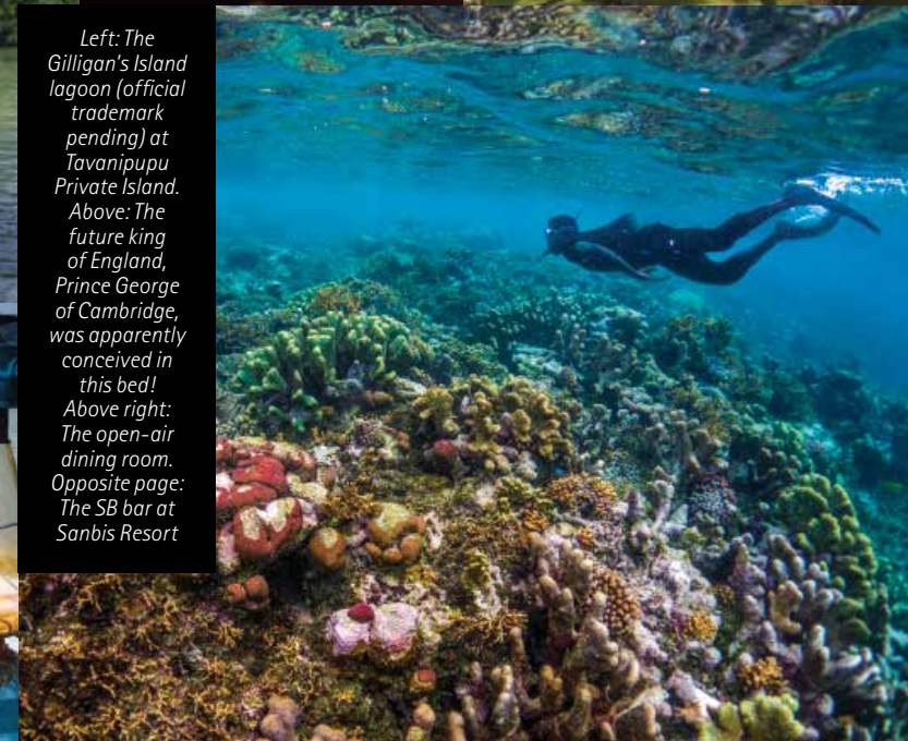
Left: The Gilligan's Island lagoon (official trademark pending) at Tavanipupu Private Island. Above: The future king of England, Prince George of Cambridge, was apparently conceived in this bed! Above right: The open-air dining room. Opposite page: The SB bar at Sanbis Resort