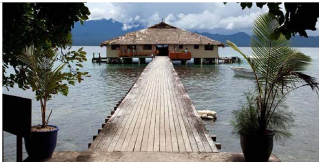
Fatboys Resort's over-water deck looks out across Gizo Lagoon to Kennedy Island.

I sit on the over-water deck of the gloriously named Fatboys Resort, lunching on the best crayfish lunch of my life (grilled, lightly dusted with garlic) and looking out across glittering Gizo Lagoon to a tiny, wooded island about a kilometre away. "It used to be called Plum Pudding Island but these days it's Kennedy Island," says Mano, Fatboys' slender manager.