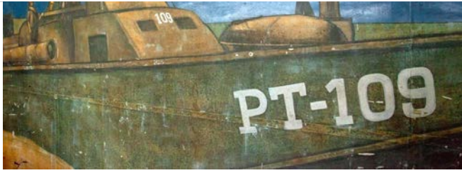
Kennedy's part in the war is commemorated at the PT-109 Bar, Gizo.

Kennedy Island lies 15 minutes by boat from Gizo, the capital of the Solomons' Western province.