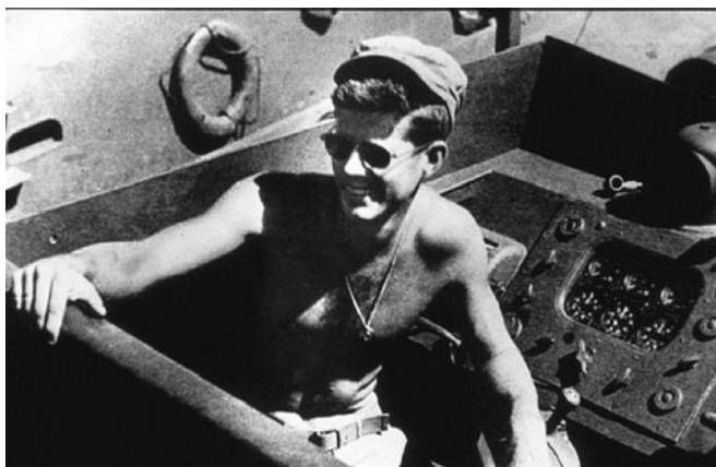
The then future US president John F Kennedy as a young naval lieutenant on PT109. Divers claim they have found the boat, sunk in WW2 by a Japanese destroyer. Picture supplied.

Two of the crew died and two others were critically injured. The 11 survivors swam for uninhabited Plum Pudding Island, with "Jack" Kennedy using a life-jacket strap clenched between his teeth to tow one of his badly burnt shipmates. It took four hours to reach the island but they found no food or water. Kennedy then swam his men far across Gizo Lagoon to the more hospitable Olasana Island.