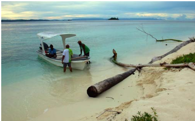
Coming ashore at Kennedy Island.

With two of the staff from Fatboys, I scoot out to it in a runabout. The island is still uninhabited and, except for its history, is fairly unremarkable, so we cross to a nearby sandbar for sundowners. Which leads to a joke session about what was the famous "rescue" message that Kennedy wrote? Was it a Warren Zevon-like memo to Dad, the wealthy and powerful Joseph P. Kennedy, "Send lawyers, guns and money"? Or, Jack being a lad (and later notorious for it), was it something like "Marooned on tropical island. Send dancing girls"?