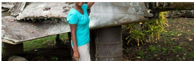
The remains of an SBD Douglas Bomber.

Famed wreck hunter Robert Ballard headed a National Geographic Society expedition that found the forward section wreckage of PT-109 in May 2002. In 2003 a race was held, re-enacting Kennedy's epic swims across the lagoon.