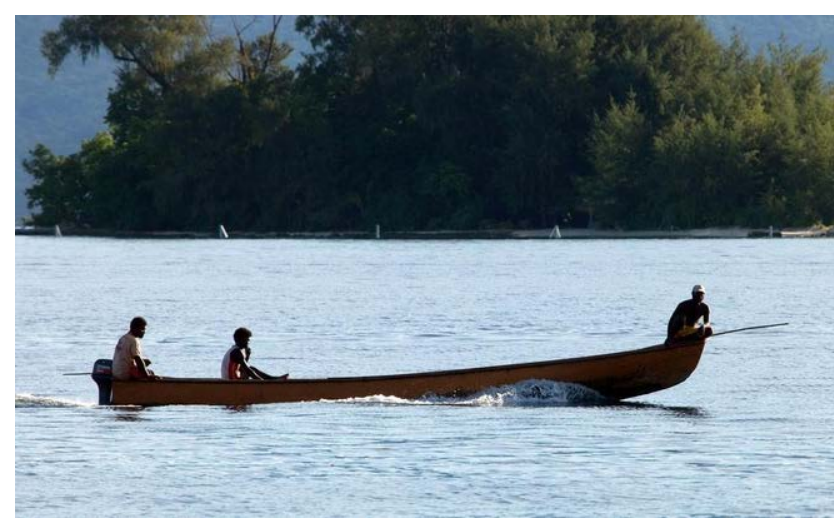
Crossing to historic Kennedy Island in the Solomon Islands.